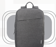
Lenovo 15.6" Laptop Casual Backpack B210