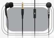
Lenovo 100 In-Ear Headphone