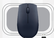
Lenovo 520 Wireless Mouse